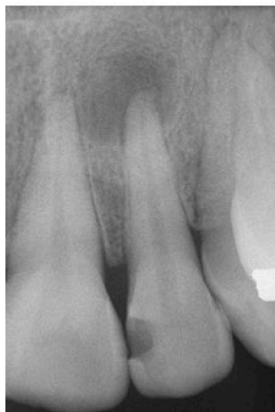
AAE Colleagues for Excellence (2013)

Theory: AP may be related to elevated systemic concentrations of inflammatory mediators or reactive peripheral blood cells, impacting general cardiovascular status